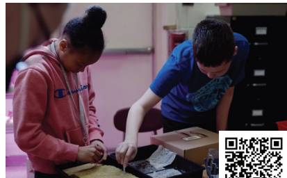
Scan the QR code to watch a playlist of videos featuring some of this year’s WASDEF-funded programs.