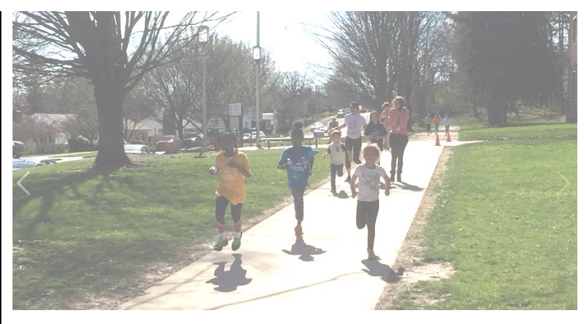
Congratulations to our awesome Third Grade girls for completing their practice 5K for Girls on the Run and embracing the theme "you are stronger than you think". Family members, peers, and faculty members cheered our girls on!

Learning Support students are notified of their assignments by personal letter.