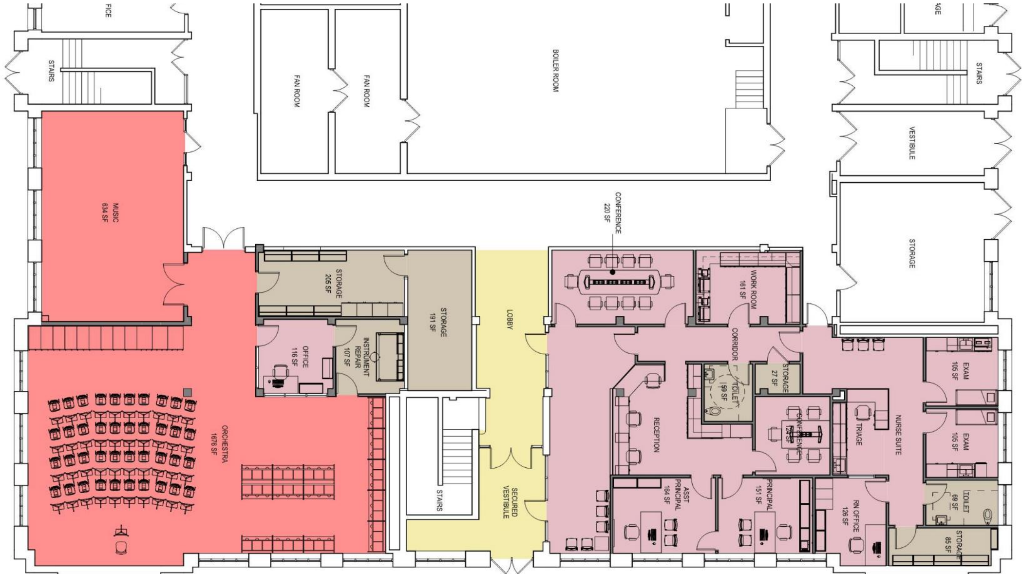
PROPOSED GROUND FLOOR