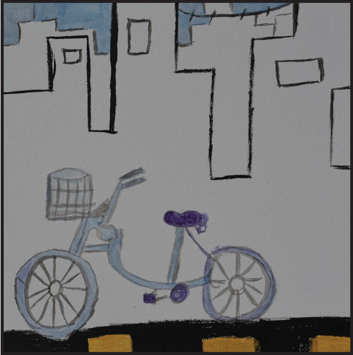
Blue Bicycle by Alexa Radulski