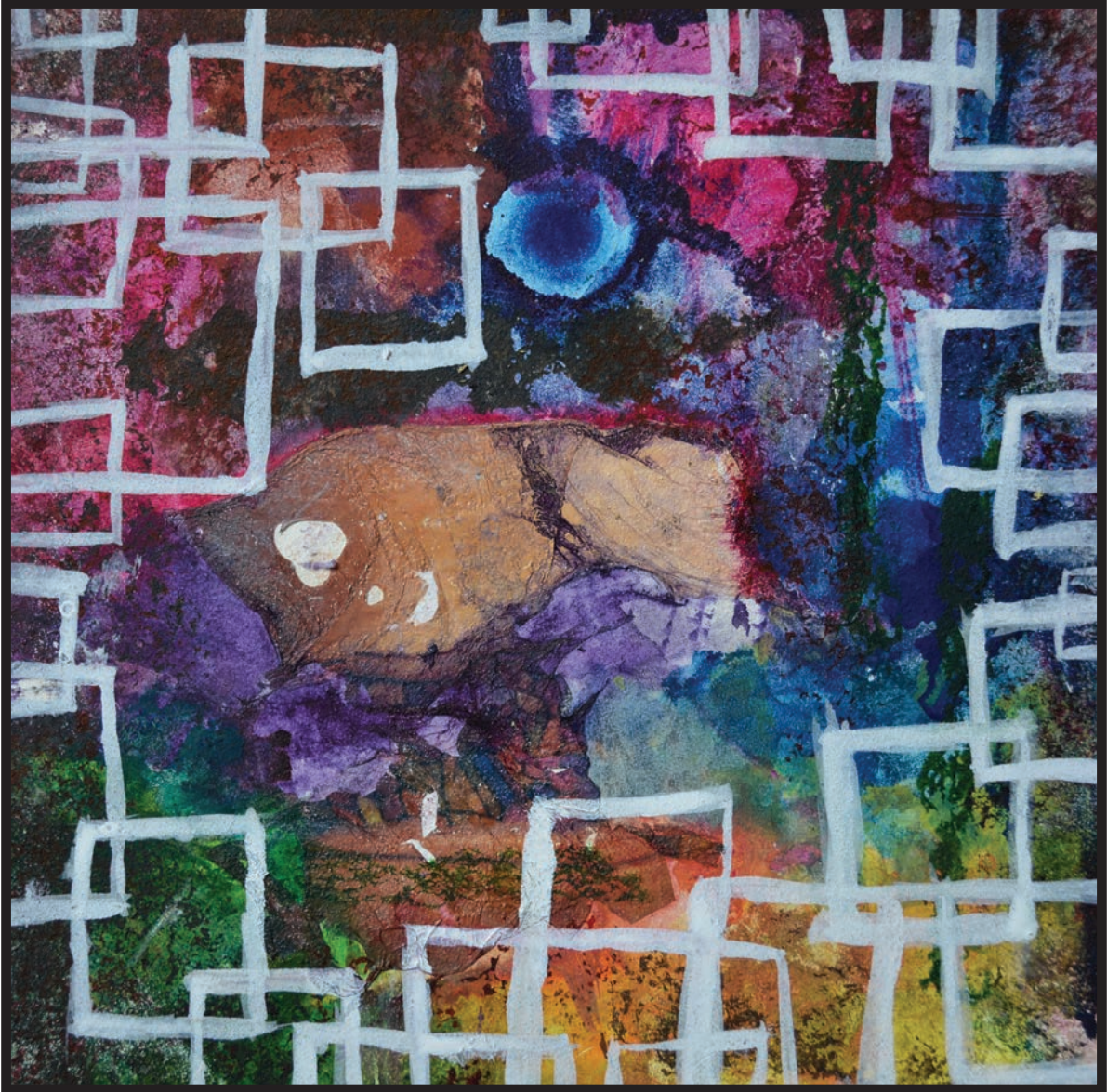
Stuck Inside by Cece Lutz