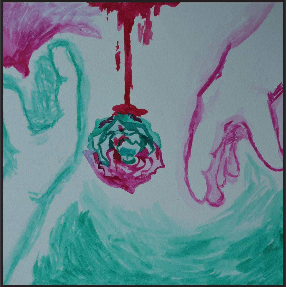
Up Dog by Sydney Pricher