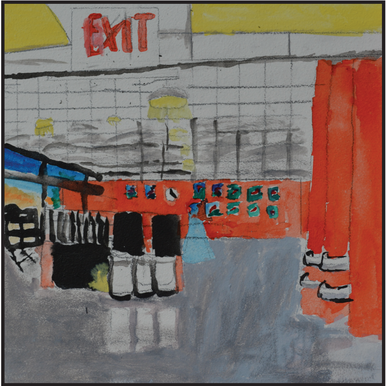
Too Soon a Memory