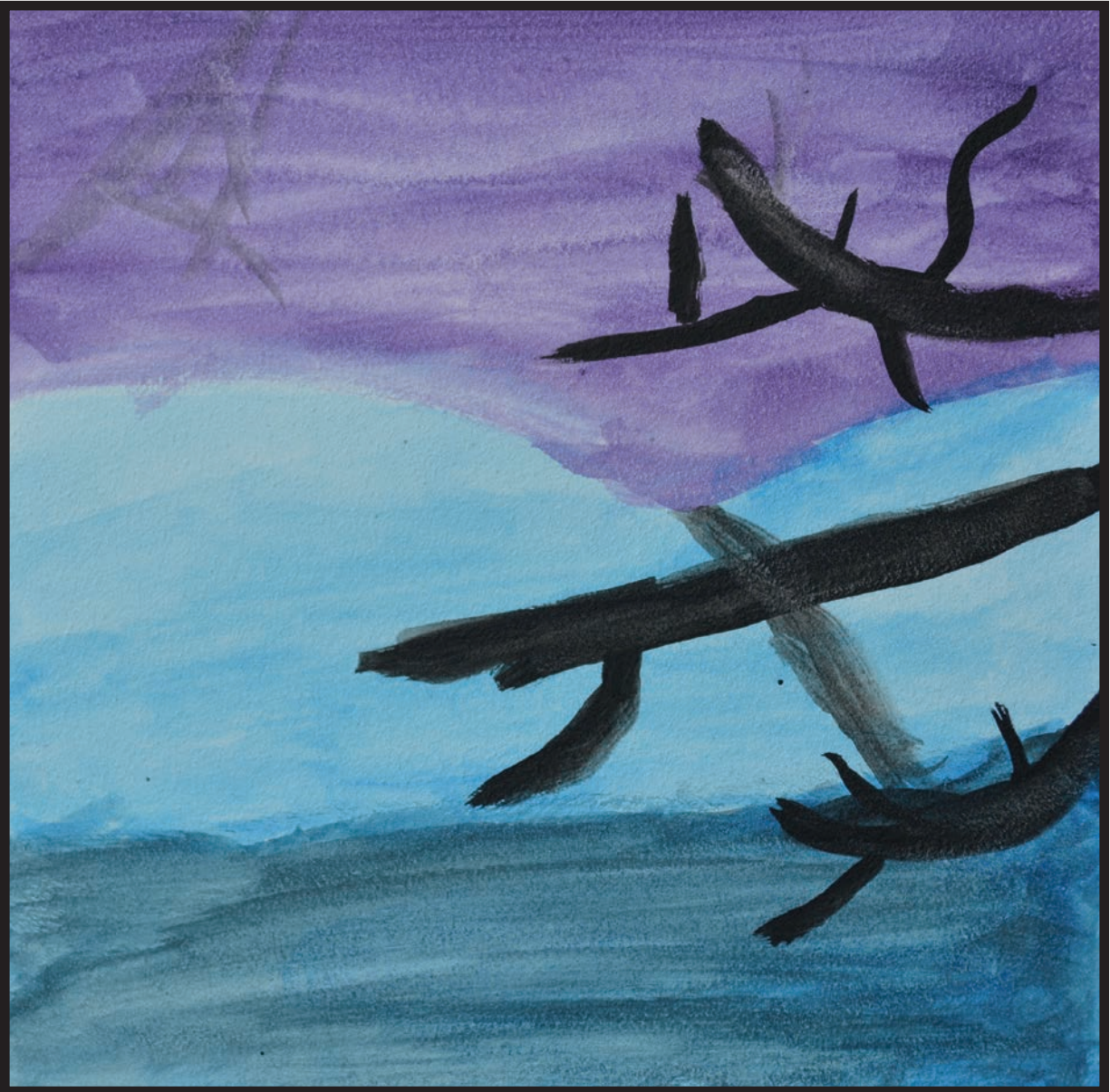
In the Dark of the Night