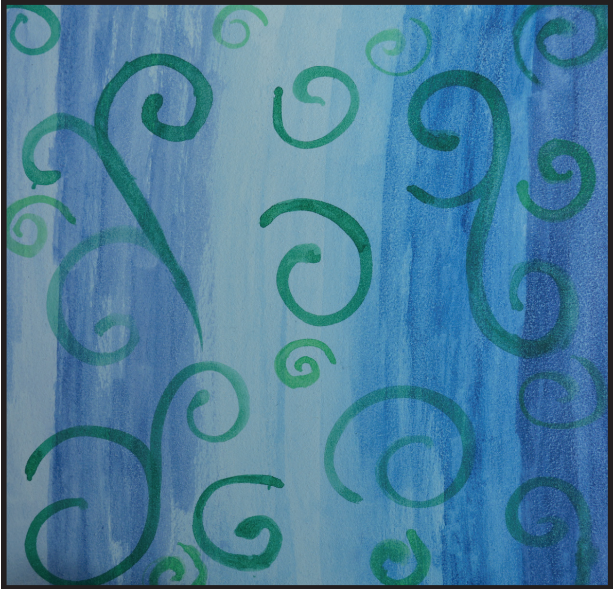
Sky Garden by Lenora Ciabattari